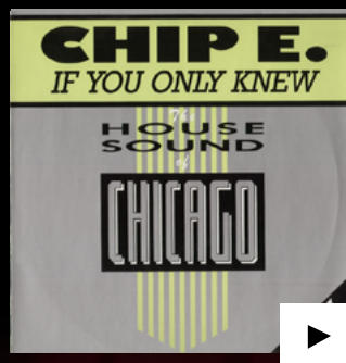
If You Only Knew Chip E.